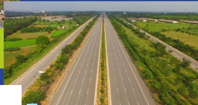
Delhi – Mumbai Expressway