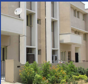
Railway Station & Quarters