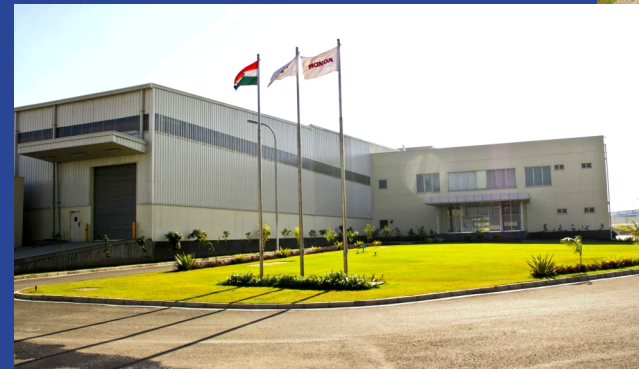
Honda Motorcycle & Scooter India Pvt. Ltd. – Vithalapur Plant