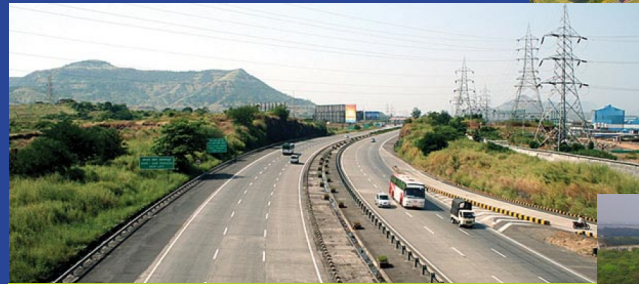
Maharashtra Samruddhi Mahamarg – Mumbai- Nagpur Expressway