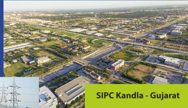
SIPC Kandla - Gujarat