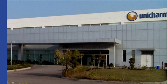
Unicharm India Pvt. Ltd. – Sanand Plant