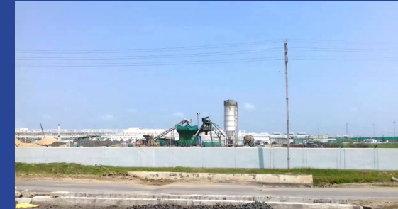
Maruti Suzuki India Ltd. – Becharaji Plant